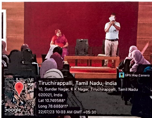
The Chief Guest stated his session. He encouraged the student how to recreate arts from waste material. And, also he distribute the pamphlet.